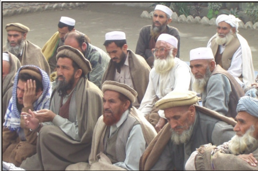
Spin Ziri or White bearded elderly Pukhtoons at a Community Conference in Afghan Refugee Camp near Peshawar.